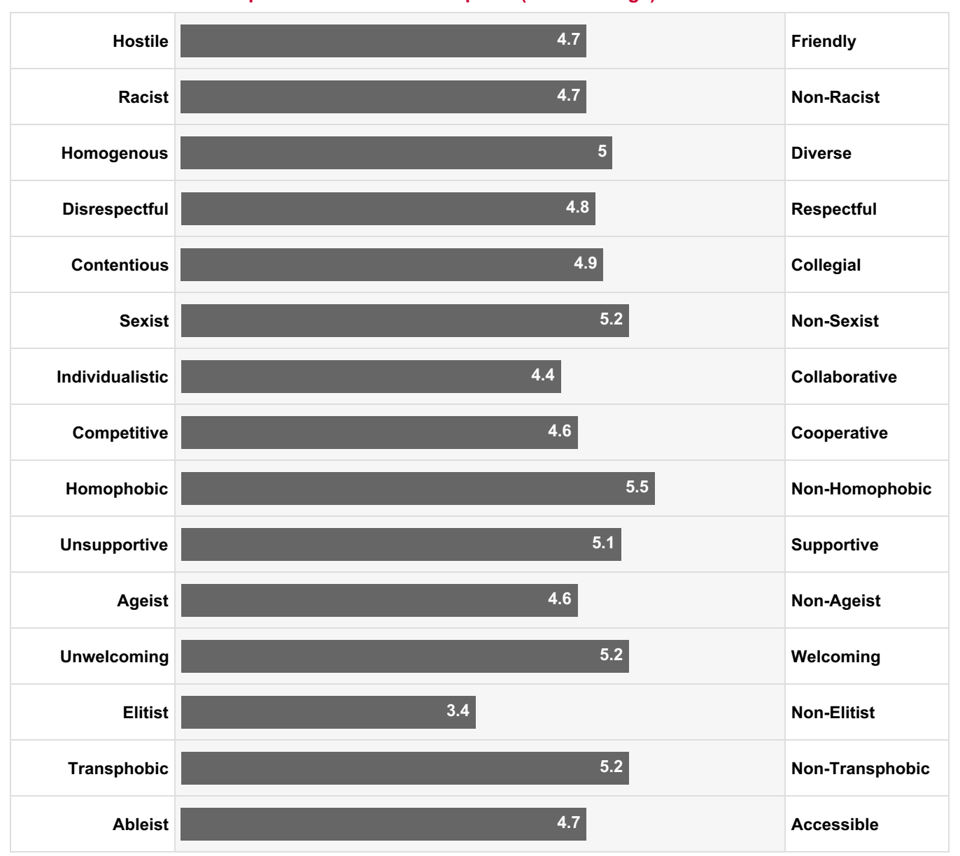
Section B - Table 10.1: Perceptions of Overall DEI Aspects (Mean Ratings)* - Staff

In the following chart, the higher the mean score shown in each bar, the closer ratings were to the positive attribute in each set of adjectives located on the right. A 7-point scale was used to evaluate the paired adjectives, thus the mean values in the following tables utilize the same scale. The colored bars represent the different groups, as defined below.