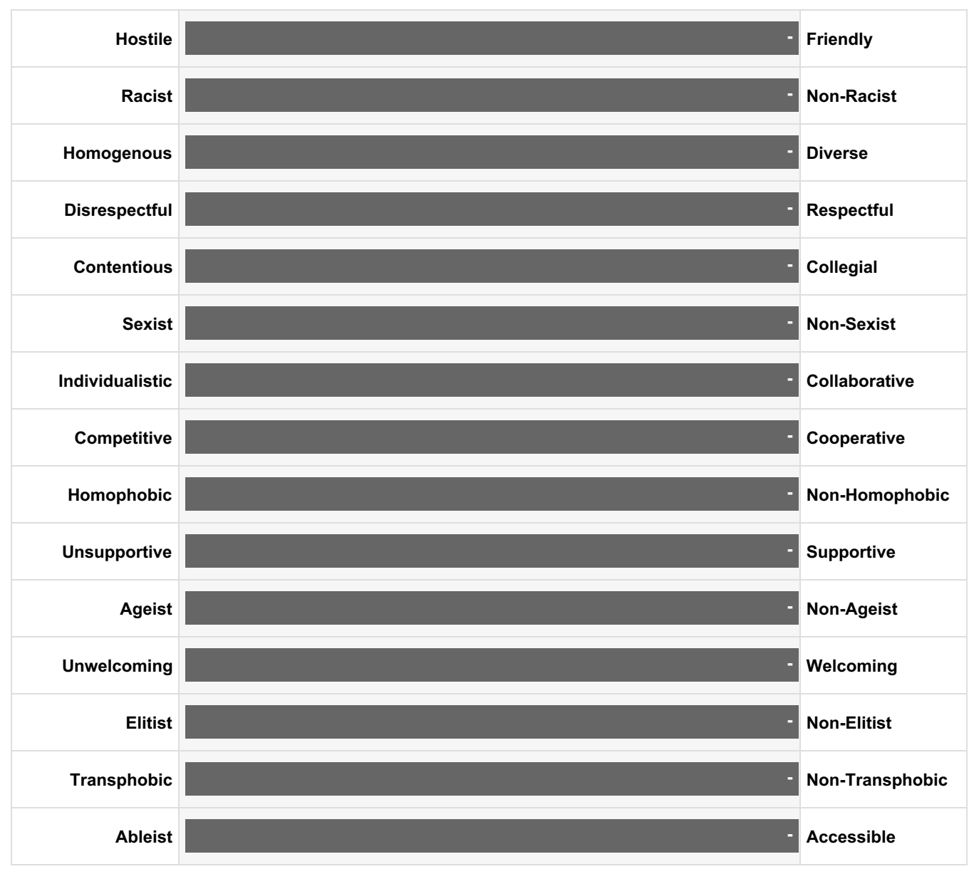
Section B - Table 10.2: Perceptions of Overall DEI Aspects (Mean Ratings)* - Faculty