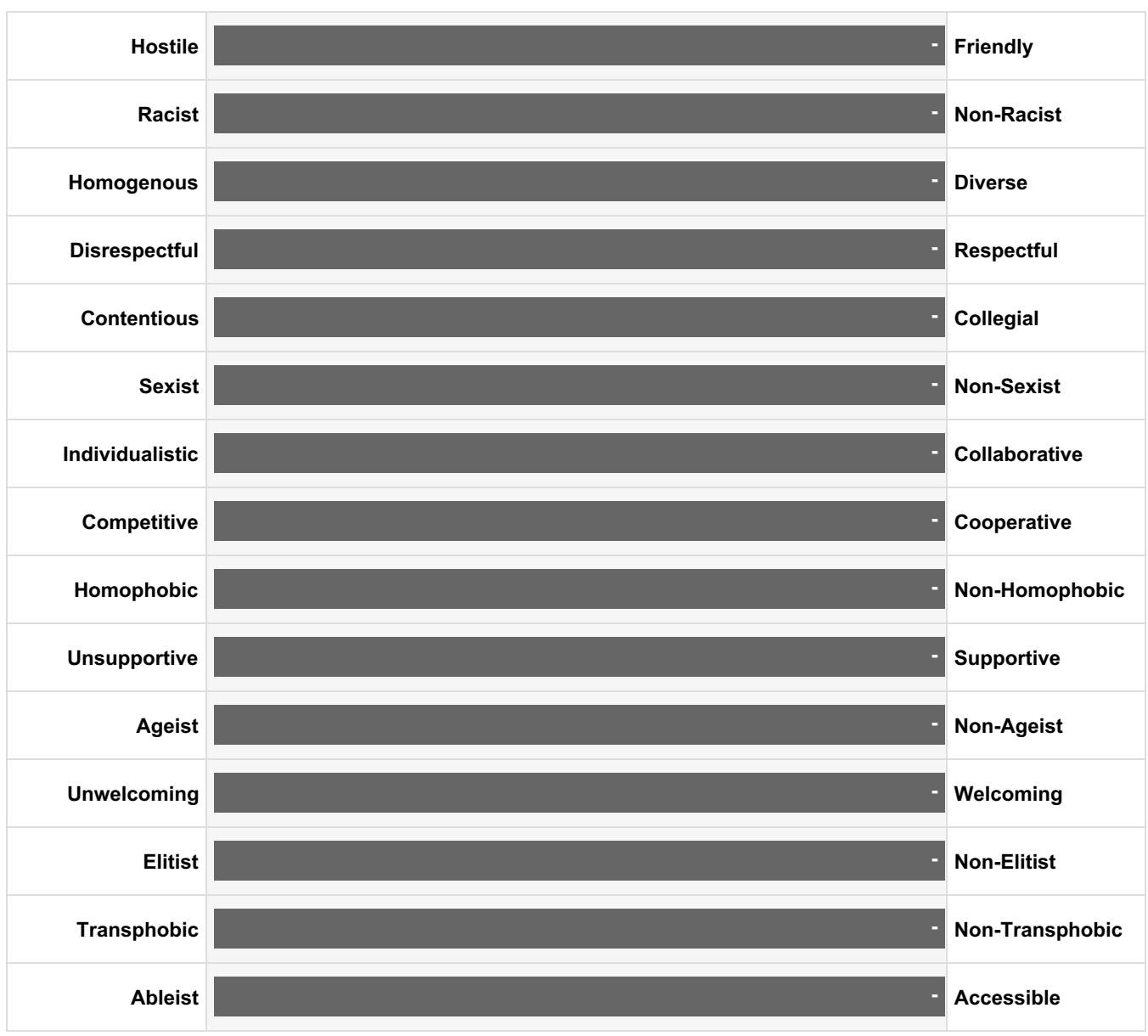
Section B - Table 10.2: Perceptions of Overall DEI Aspects (Mean Ratings)* - Faculty